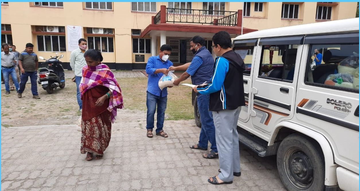
Distribution of essential items