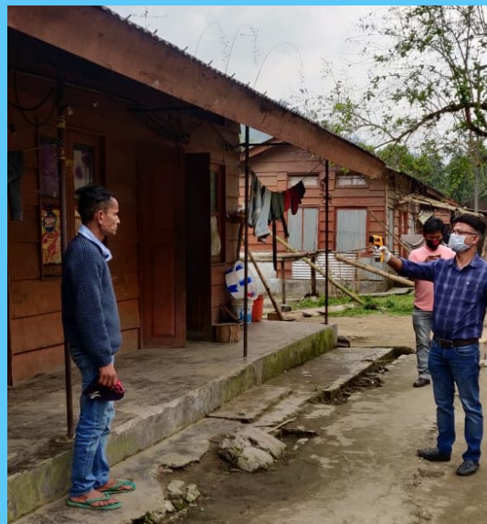
Awareness and temperature check at Kimi village