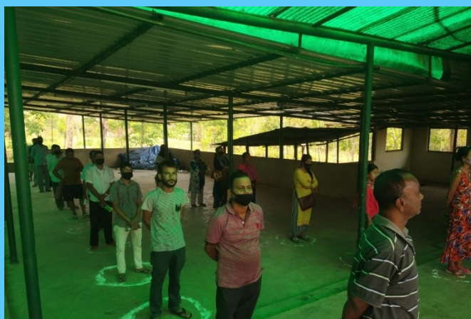
Distribution of essential items