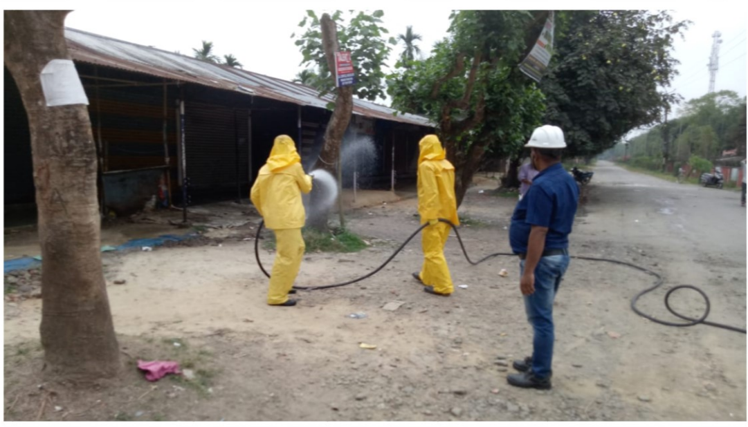
Spraying disinfectant at Market area outside AGBP gate