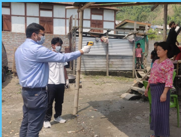
Awareness and temperature check at Rai colony, Kimi