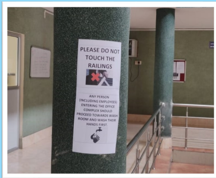
Awareness Posters at vulnerable surface areas