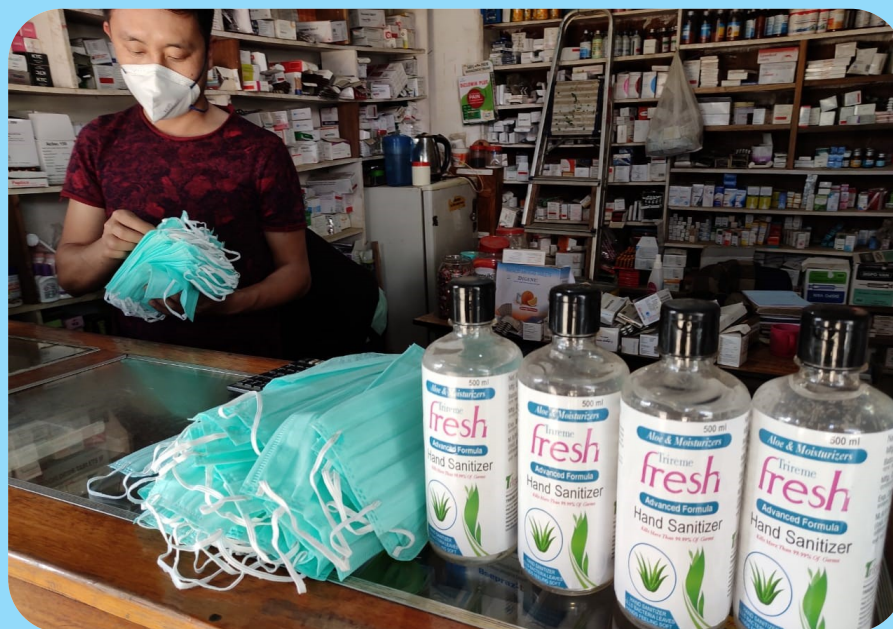
Distribution of masks and sanitisers