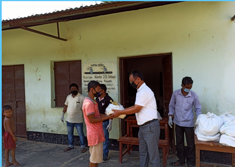
Relief items distributed at Thalibari village under Sepahijala district in presence of Block Development Officer, Kathalia block