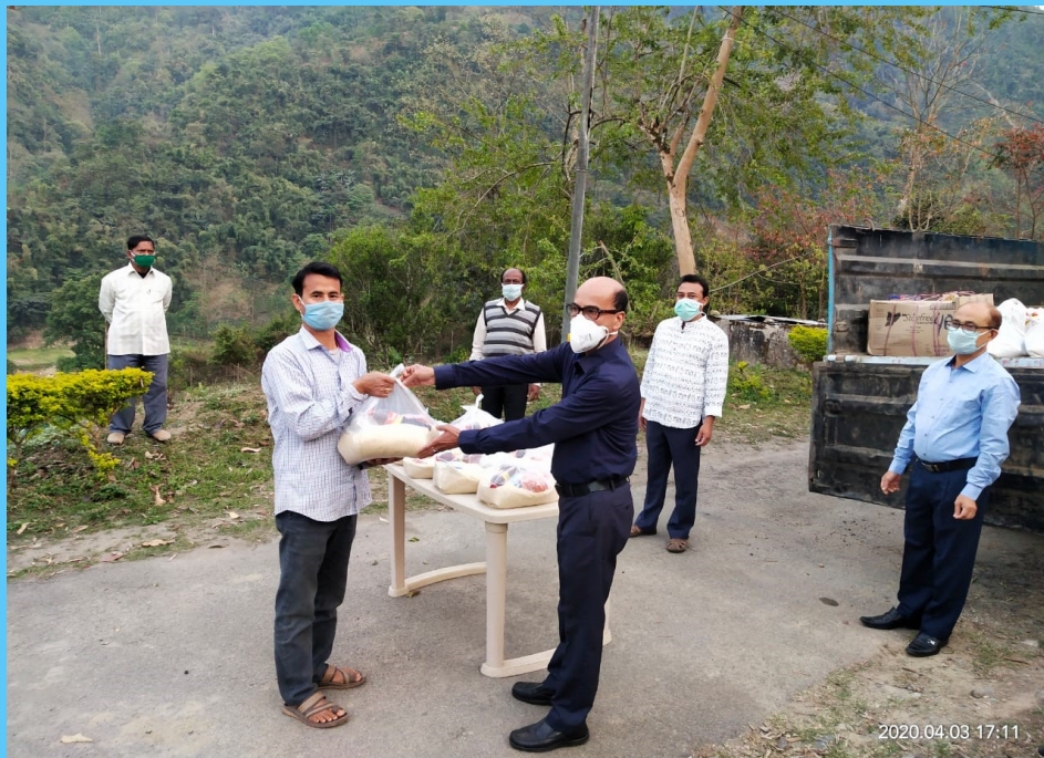
Essential items being distributed