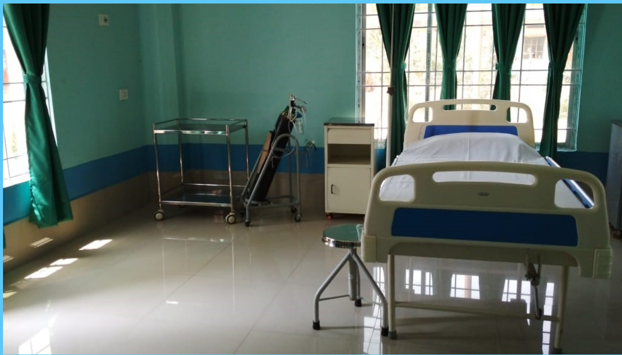
Quarantine Ward set up