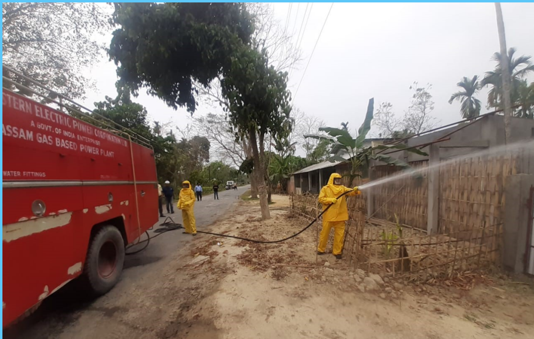
Spraying disinfectant in AGBP Bhadoi Road