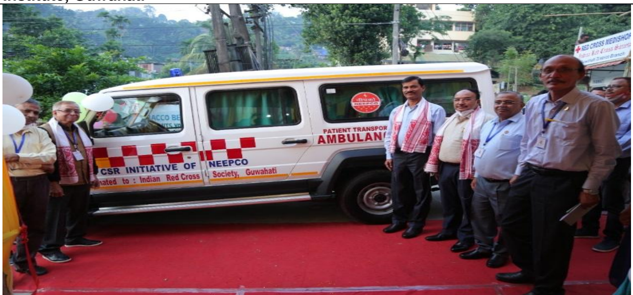
Donation of Ambulance to Red Cross Hospital, Guwahati, Assam