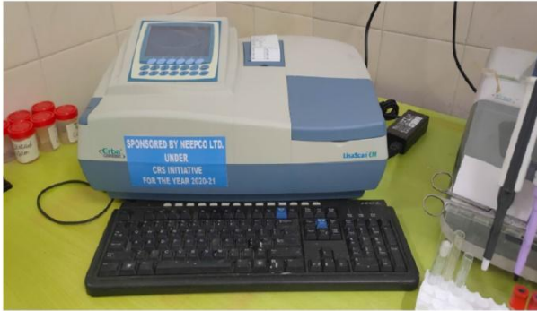
Providing of Immunoassay Analyser to Civil Hospital, Nongpoh, Ribhoi, Meghalaya.