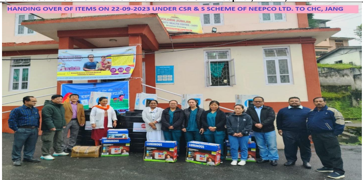
Handing Over of items for Community Health Centre, Jang, Distt.- Tawang, Arunachal Pradesh.