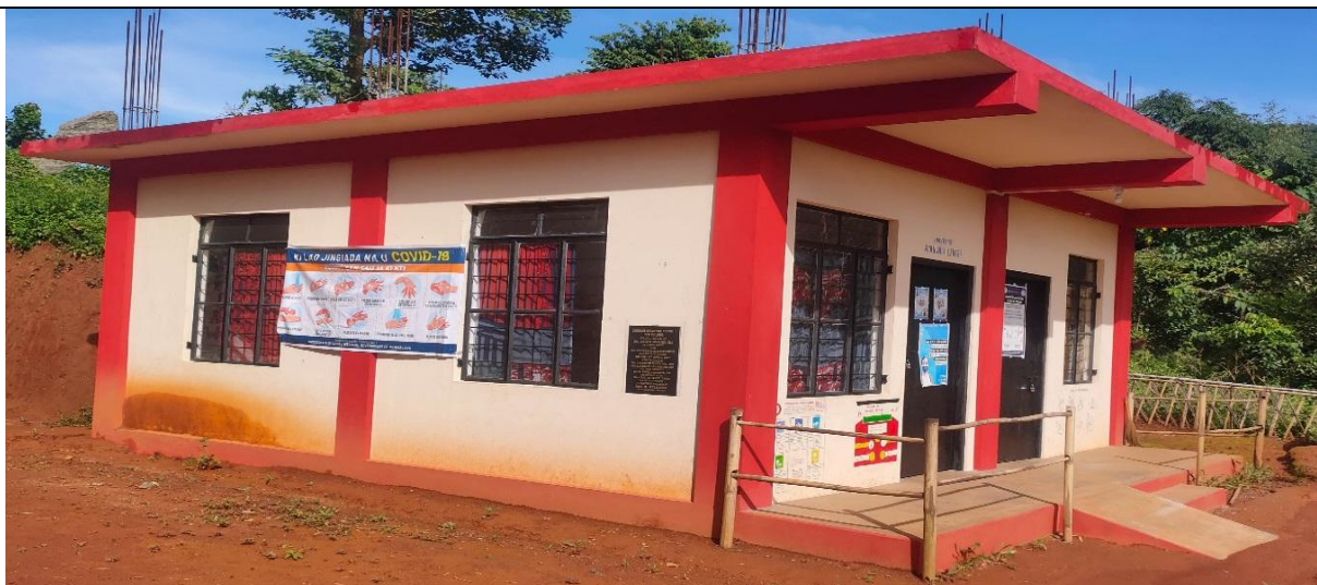
Newly constructed Anganwadi Centre at Umkaduh-II, Ri Bhoi Distt., Meghalaya

Medical Equipment was sponsored under CSR initiatives by NEEPCO during 2020-21 for Civil Hospital Nongpoh at sanctioned amount of Rs. 1.24 Crore. Medical Machines and Equipment such as Centralized Gas Pipeline (Oxygen & Vacuum) system for the different wards in Hospital Sterile areas like ICU, OT, New Born Sick Unit, Labour Room etc. were very effective in present pandemic situation. Also, a High definition Laparoscope Set was sponsored so that patients do not have to travel to Shillong or Guwahati for basic Laparoscopic surgeries.