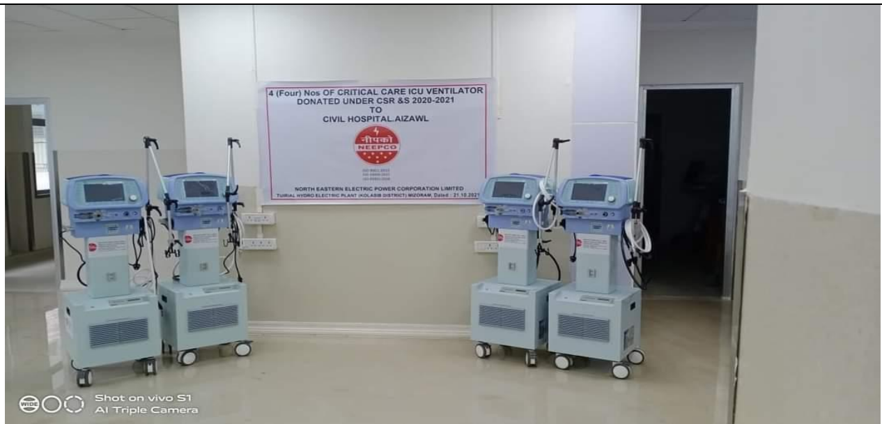
Critical Care ICU Ventilators donated to the Civil Hospital, Aizawl, Mizoram.