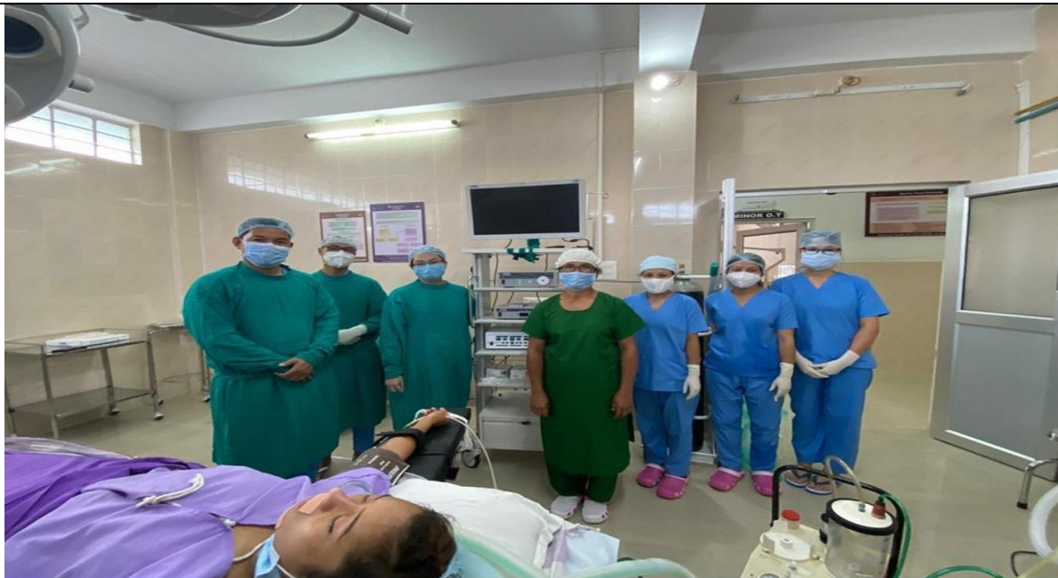
Providing Medical Instruments for Laparoscopic Surgery at Nongpoh Civil Hospital, Ribhoi District, Meghalaya.