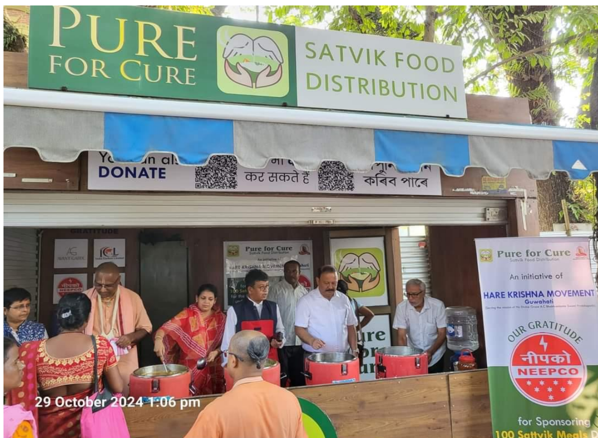
Satvik Meals distributed to the patients and their attendants by the NEEPCO officials at the Kiosk set for the purpose at B.Borooah Cancer Institute, Guwahati, Assam.

Photographs of Healthcare initiatives undertaken by NEEPCO: