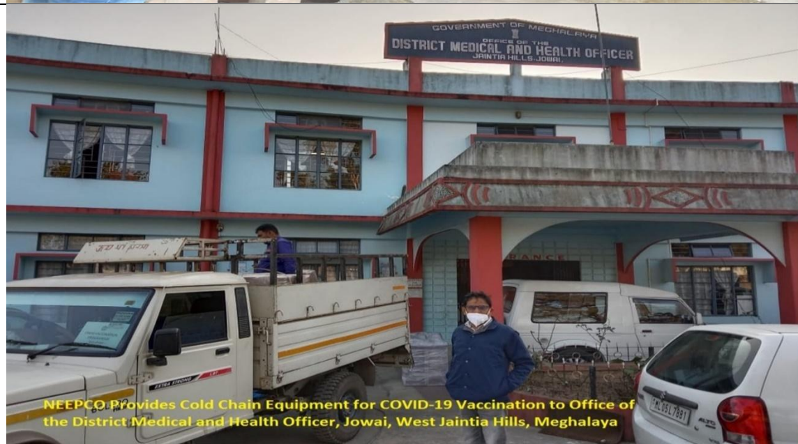
NEEPCO Provides Cold Chain Equipment for COVID-19 Vaccination to Office of the District Medical and Health Officer, Jowai, West Jaintia Hills, Meghalaya