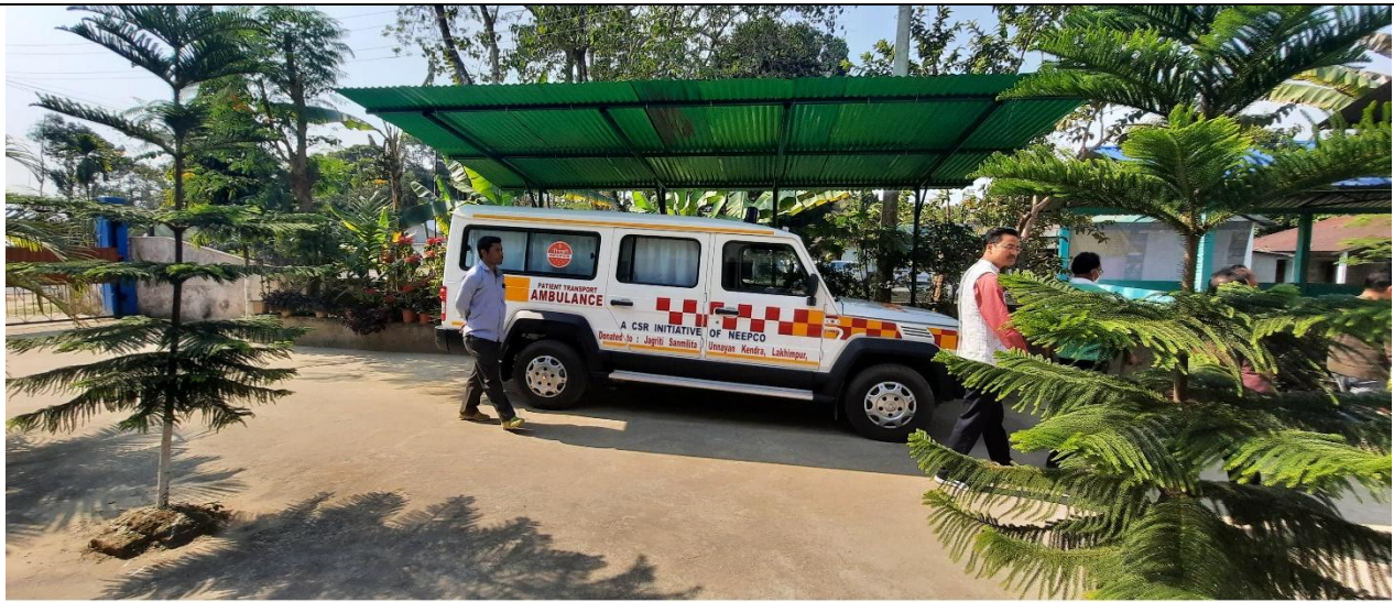
Providing Ambulance to Jagriti Sanmilita Unnayan Kendra, Lakhimpur, Assam