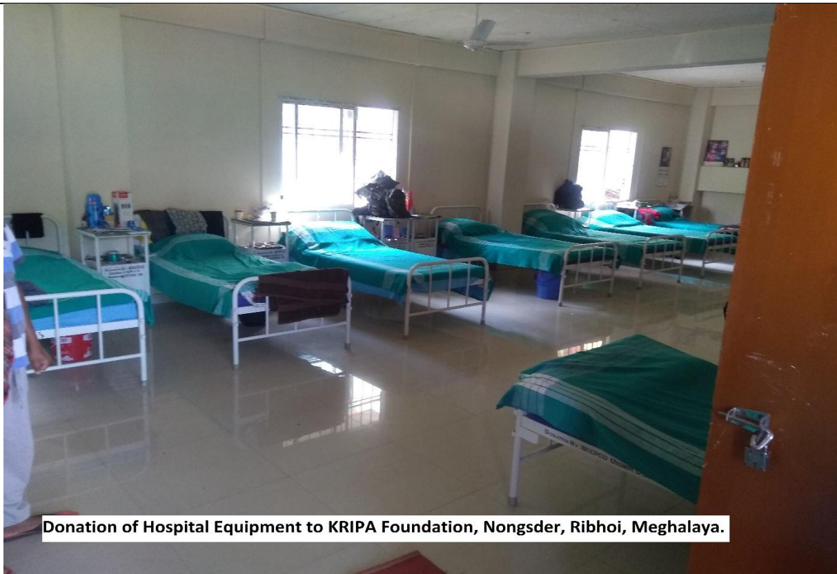
Donation of Hospital Equipment to KRIPA Foundation, Nongsder, Ribhoi, Meghalaya.

CSR ACTIVITIES DURING COVID-19 PANDEMIC: As a responsible corporate citizen NEEPCO is making all efforts towards containment of the spread of COVID-19 pandemic. Therefore, considering the COVID- 19 situation, NEEPCO has distributed PPE items such as triple layer masks, hand sanitizers and liquid hand wash to the populace in and around its operational areas. NEEPCO under its CSR initiative