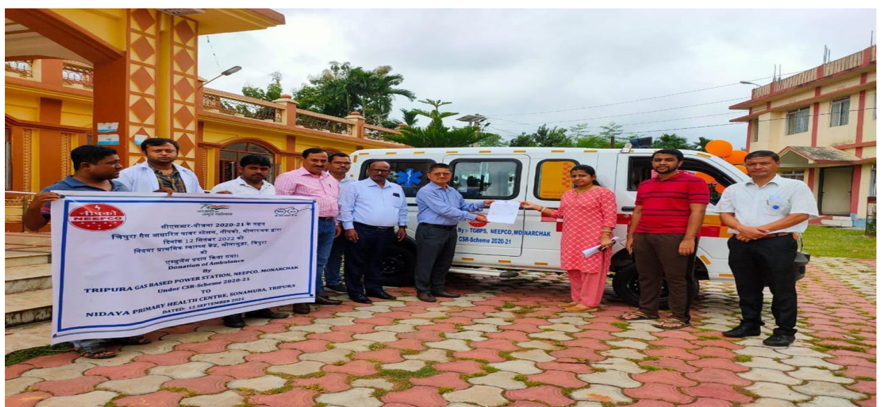
Providing an Ambulance to Nidaya Primary Health Centre, Sonamura, Tripura