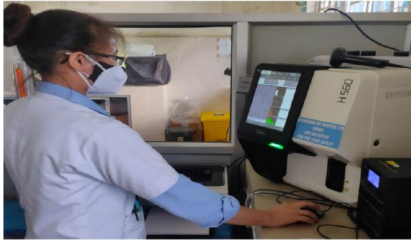
Providing of Fully Automatic Haematology Analyser to Civil Hospital, Nongpoh, Ribhoi, Meghalaya.