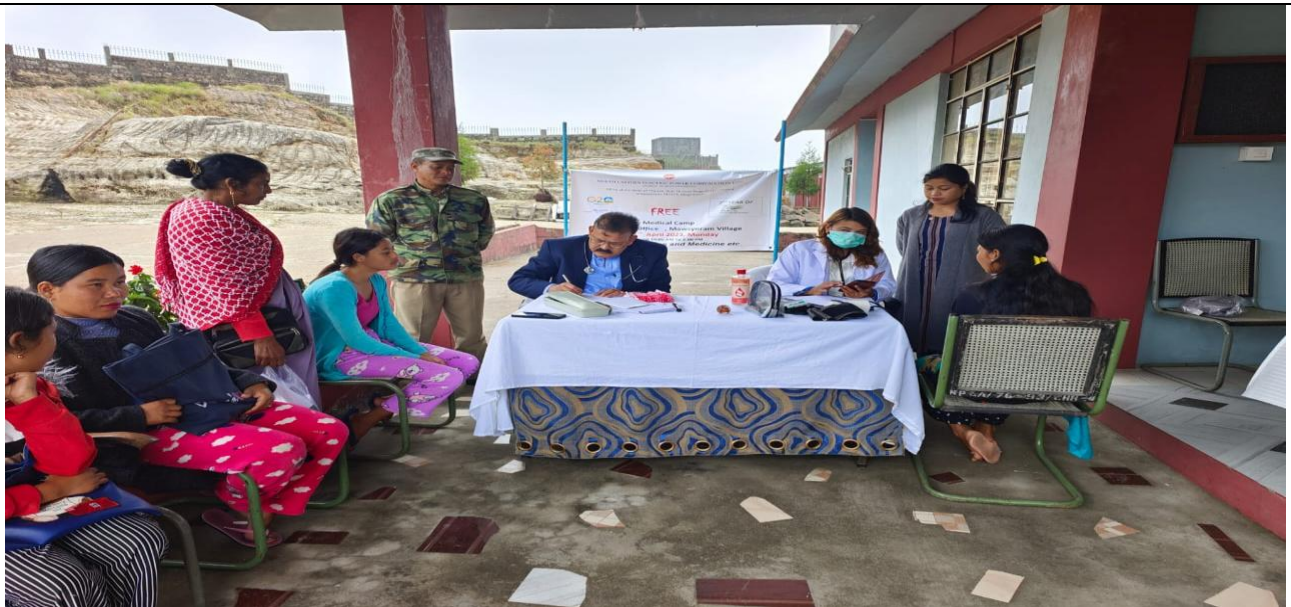
Medical camp organised by WUHEP, NEEPCO, Mawsynram, Meghalaya.