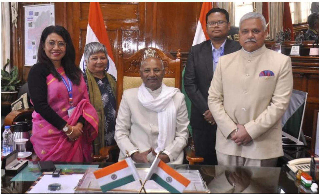
MoA signed between Raj Bhavan, Shillong and NEEPCO under the Pradhan Mantri TB Mukta Bharat Abhiyaan for nutritional support to 250 numbers of TB patients in Meghalaya