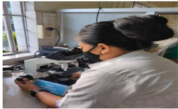
Providing of Microscope to Civil Hospital, Nongpoh, Ribhoi, Meghalaya.