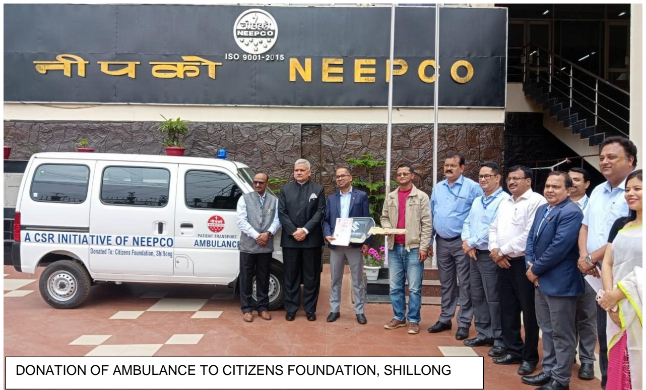
DONATION OF AMBULANCE TO CITIZENS FOUNDATION, SHILLONG