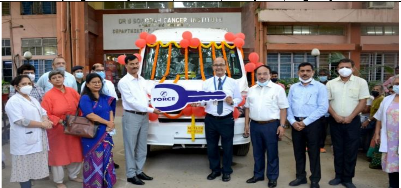
Handing over of Force Traveller (13+D) AC Vehicle to Dr. B. Borooah Cancer Institute, Guwahati