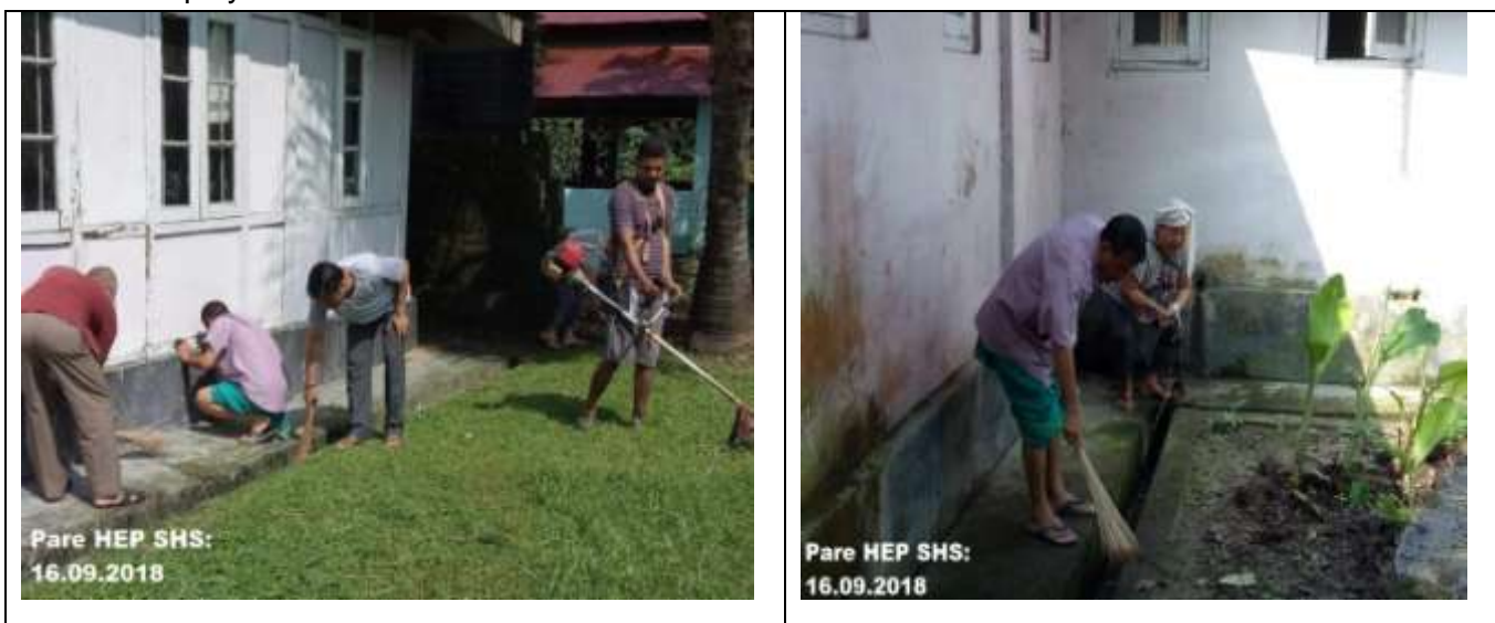
Pare HE Project, Arunachal Pradesh

Similarly at Pare HE Project, Arunachal Pradesh, cleaning was undertaken in and around NEEPCO KG School by employees, school authorities and family members of employees on 16.09.2018 which was followed by a mass social service/cleaning drive of office complex and colony by the employees and their families on 20.09.2018 and 21.09.2018. A total of almost 100 employees and family members in involved in the activity. Similar activity was undertaken at Colony Complex by the 100 employees on 24.09.2018.