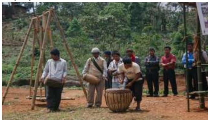
Nongkhrach, Ri Bhoi District, Meghalaya