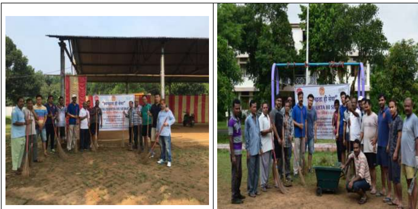
Tripura Gas Based Power Plant (TGBPP), Tripura

In Tripura Gas Based Power Plant (TGBPP), Tripura cleaning drives were held on 15.09.2018 surrounding the Administrative Building of the plant, followed by the same around the Erector's Hostel on 19.09.2018 and around the Effluent Treatment Plant (ETP) on 20.09.2018, with around 50 employees and their family members involved in the drives.