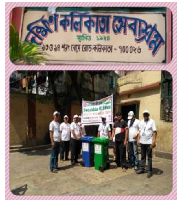
Dakhin kalikata Sevashram, Kolkata