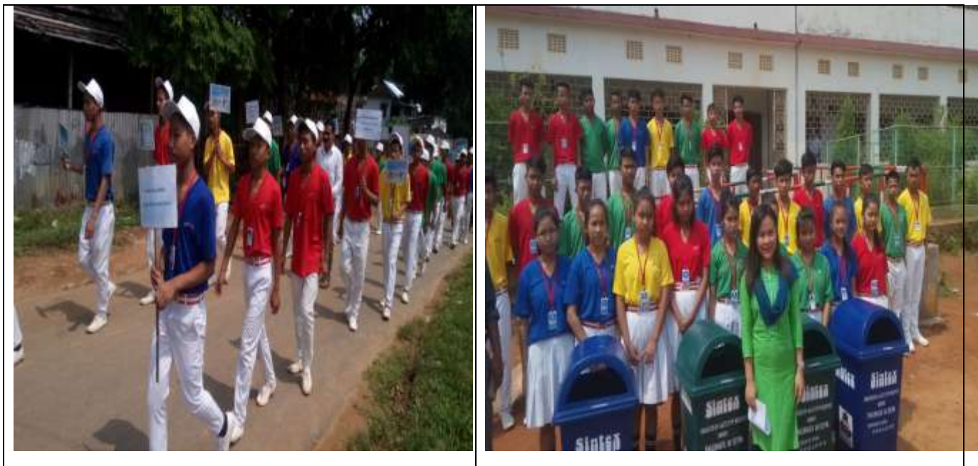
Standard English Medium School, Kisong, R C Nagar, Tripura