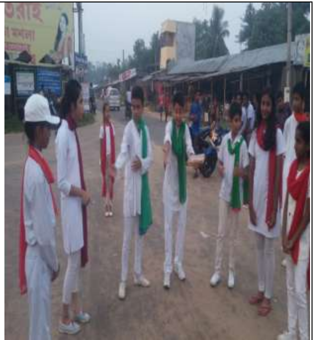
Banikya Chowmuni Bazaar Road

TGBPP, Tripura organized a similar programme on 27.09.2018 at Ballerdhapa HS School wherein 35 students participated.