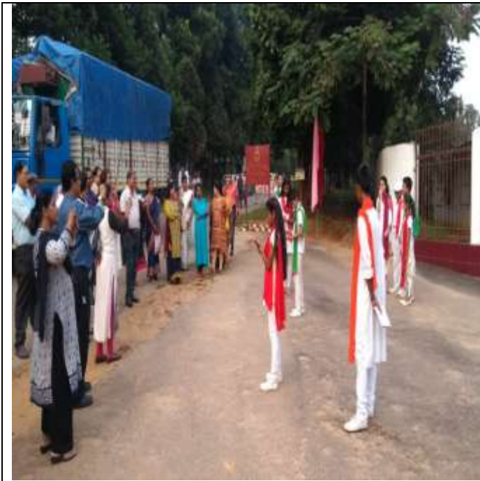
Tripura State Rifles 2 nd Battalion campus

AGTCCPP, Tripura also organized Swachhata related Street Plays at front gate of Tripura State Rifles 2 nd Battalion campus at R.C. Nagar and at Banikya Chowmuni Bazaar Road on 01.10.2018 wherein 30 school students participated. Also organized Folk Song and dance performance in connection with 'Swachhta Hi Seva at NEEPCO Colony, AGTCCPP, R.C. Nagar, Tripura (West) 28.09.2018