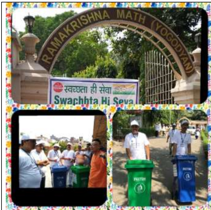
Ramakrishna Mission, Jagodyan, Kankurgachi