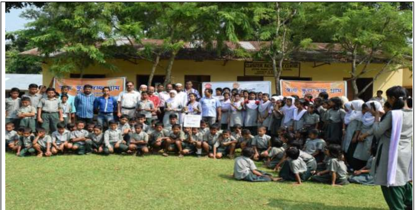
Ballerdhapa HS School, Tripura

TGBPP, Tripura organized a similar programme on 27.09.2018 at Ballerdhapa HS School wherein 35 students participated.