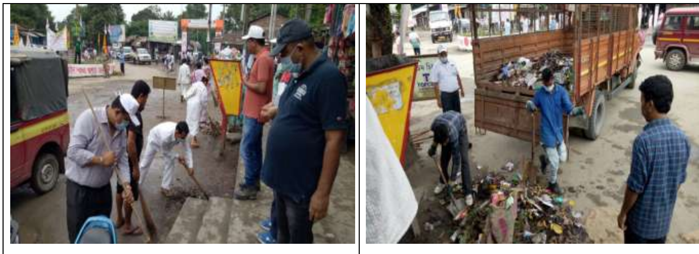
Assam Gas based Power Plant, Assam at Bhadoi Panchali, Dibrugarh.

Similarly, cleaning activities were undertaken by around 50 employees and their families of Assam Gas based Power Plant, Assam on 27.09.2018 at Bhadoi Panchali, Dibrugarh.