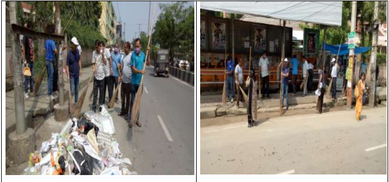
R.G. Baruah Road (Sunderpur Area) and City Bus Stop, Sunderpur, Guwahati, Assam

Cleaning activities were undertaken by Guwahati Office in between 15.09.2018 and 02.10.2018 at R.G. Baruah Road (Sunderpur Area) and City Bus Stop, Sunderpur, Guwahati, Assam with the involvement of around 30 employees of NEEPCO.