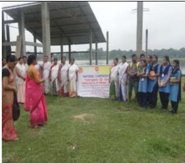
Sesoni Merbill Village in Dibrugarh

Kopili HE Project, Assam also organized an awareness campaign at NRC Building, KHEP with the participation of 80 employees and family members on 25.09.2018.