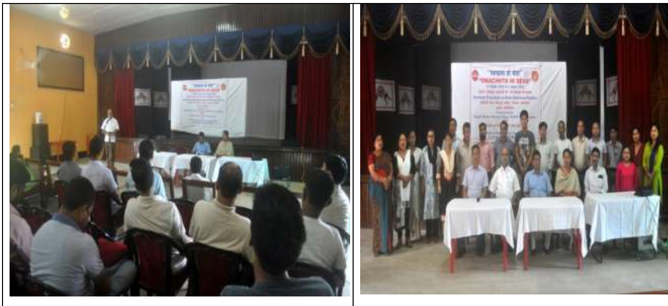
NRC Building, KHEP

An awareness campaign was also organized by Guwahati Office, with school students of Dimoria High School, Assam during the period 27.09.2018 between 02.10.2018 with the participation of 20 students. Each student was given one bottle of liquid hand wash soap dispenser to motivate them to wash their hands frequently.