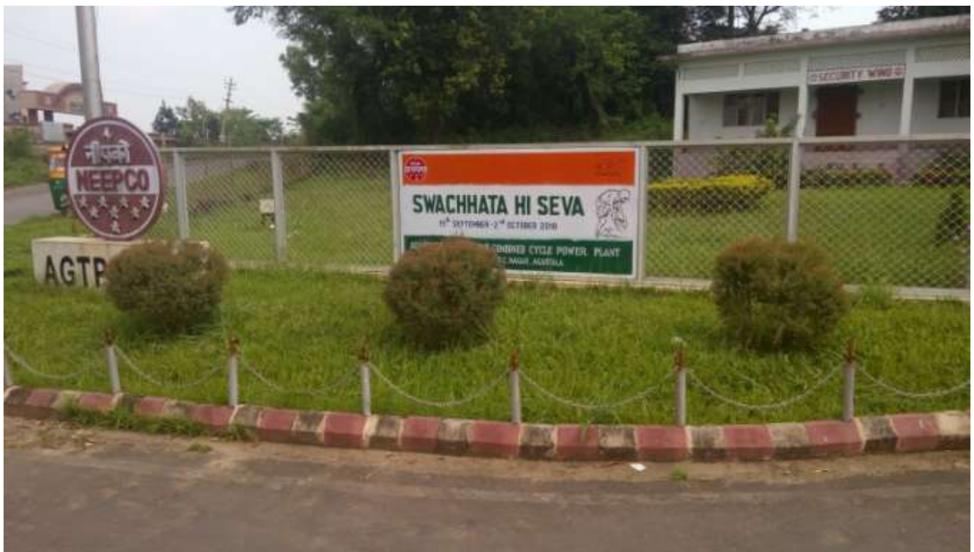
AGTCCPP, Tripura Plant's Main Gate

AGTCCPP, Tripura organized a similar wall painting at its Plant's main gate on 28.09.2018 with a participation of 50 volunteers.