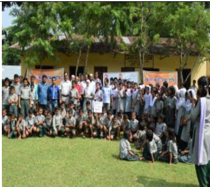
Ballerdhapa HS School, Sepahijala

In TGBPP, Tripura awareness campaign was organized in Ballerdhapa HS School, Sepahijala on 27.09.2018 and in Sovapur Girls High School, Sovapur, Sepahijala on 28.09.2018 wherein 35 and 25 students respectively participated. On 29.09. 2018 similar exercise was organized at J.B. School, Uttar Monarchak.