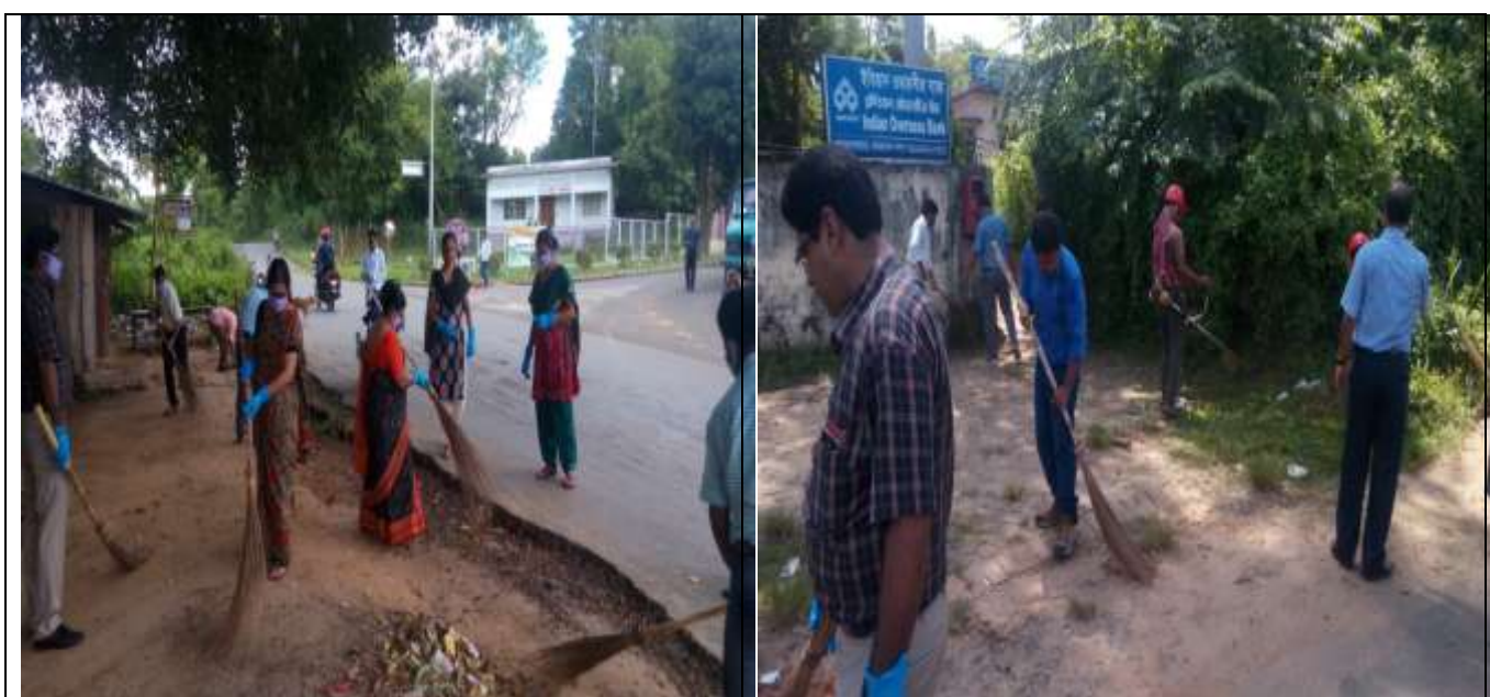
NEEPCO Chowmuhani (entry) to IOB Bank Chowmuhani Street, R.C. Nagar, Tripura (West)

As a part of activities “SWACHHTA HI SEVA”-2018, a Cleaning drive was organized by the employees of Agartala Gas Turbine Combined Cycle Power Plant (AGTCCPP) at NEEPCO Chowmuhani (entry) to IOB Bank Chowmuhani Street, R.C. Nagar, Tripura (West) on 22.09.2018 where 36 nos. of employees of AGTCCPP, NEEPCO participated in the said cleanliness drive.