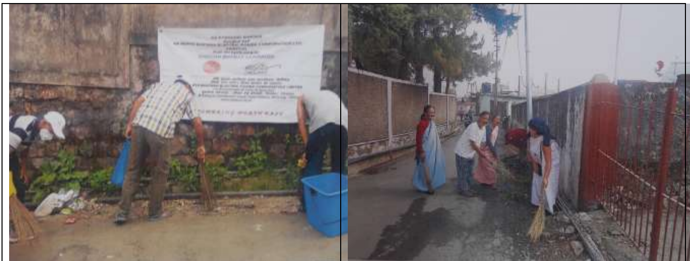
Nongkhyriem, Nongthymmai, Shillong, Meghalaya

In Tripura Gas Based Power Plant (TGBPP), Tripura cleaning drives were held on 15.09.2018 surrounding the Administrative Building of the plant, followed by the same around the Erector's Hostel on 19.09.2018 and around the Effluent Treatment Plant (ETP) on 20.09.2018, with around 50 employees and their family members involved in the drives.