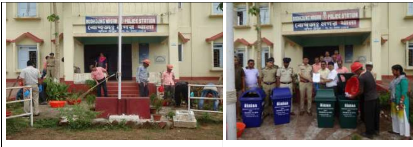
Police Station Bodhjung Nagar, Tripura

Similar activities were carried out in security areas and residential complexes by employees of TGBPP on 17.09.2018 and 18.09.2018 respectively. 20 & 15 employees were involved in the respective activities.