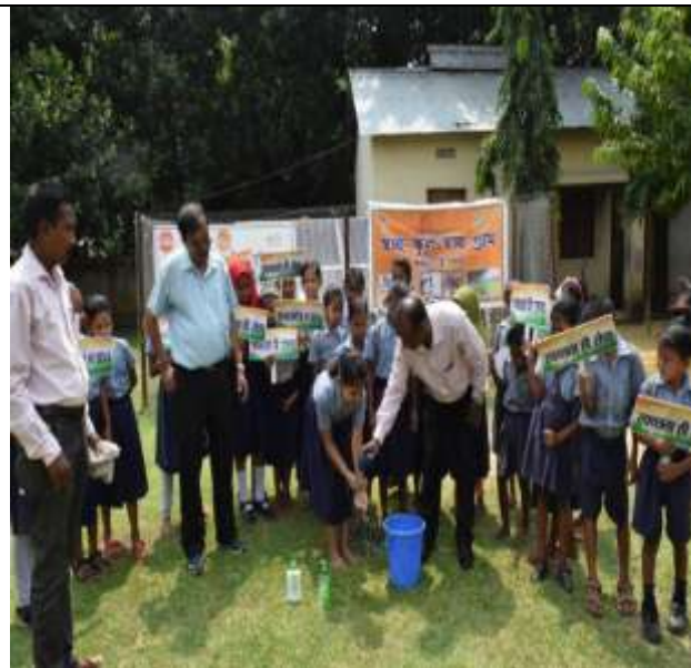
J.B. School, Uttar Monarchak

Similar awareness was conducted at Sesoni Merbill Village in Dibrugarh District of Assam by Assam Gas based Power Plant on 26.09.2018 wherein 60 villagers participated.