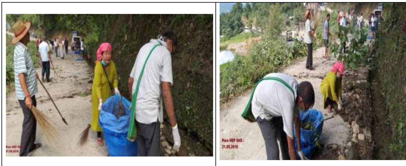
Pare HE Project

A Mass Social Service to clean public streets/drains by employees and general public in their respective colonies and wards from NEEPCO Colony to Lower NEEPCO Colony (up to Rono Village) along with collection of waste/garbage and proper disposal through municipal vans was organized at Pare HE Project on 21.09.2018 with the participation of 105 employees and family members.