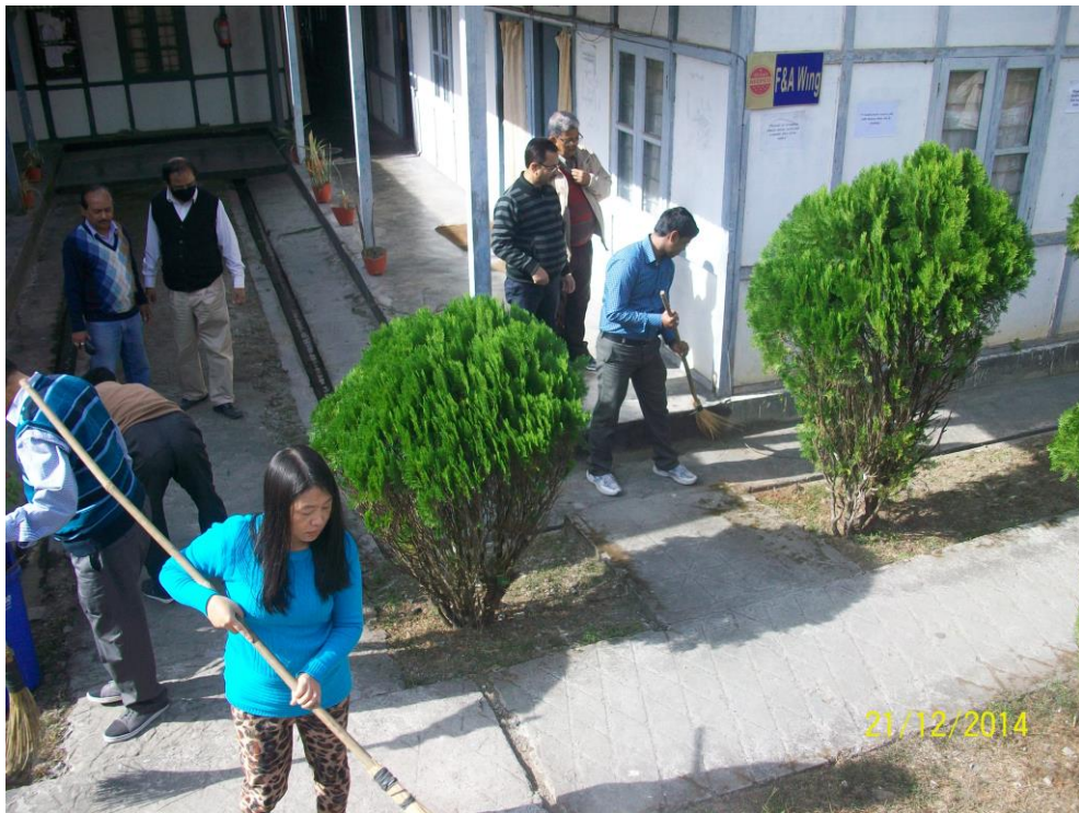
Kimi, Kameng Hydro Electric Project, Arunachal Pradesh, 21 st December 2014