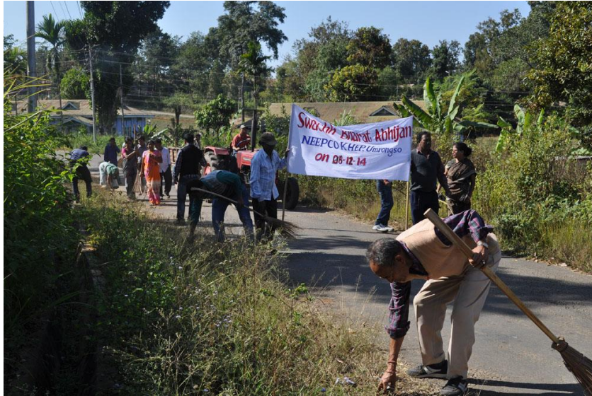
Kopili Hydro Electric Plant, Assam. 6 th December 2014.