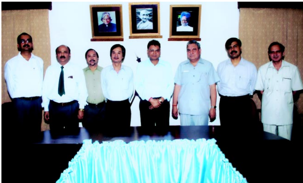
Members of the Board at the AGM

Pradesh. The Corporation is also preparing the DPR for Dibbin HE Project (100 MW) and Kapak Leyak HE Project (160 MW), both in Arunachal Pradesh and Mawhu HE Project (120 MW) in Meghalaya, which are expected to be completed by March, 2007.