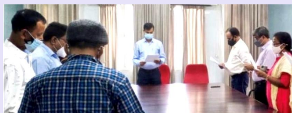
Coordination Office, Guwahati