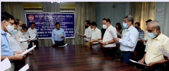
Coordination Office, Guwahati