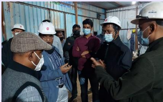
KHPS on 16.11.2021