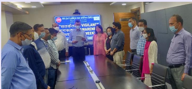
Corporate Affairs, Delhi