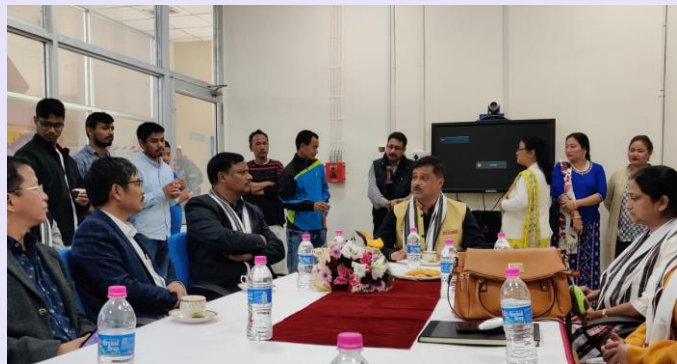
PHPS on 27.12.2021