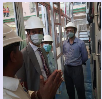
THPS on 27- 28.12.2021