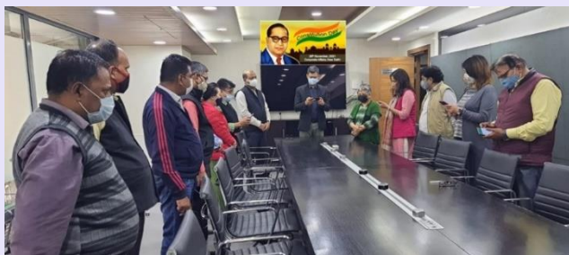
Corporate Affairs, Delhi