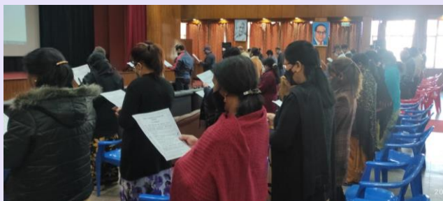
Corporate Office, Shillong