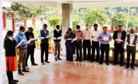
Coordination Office, Guwahati