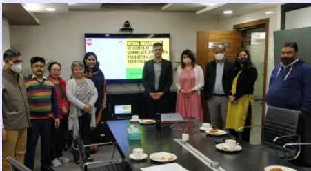
Corporate Affairs, Delhi

In RHPS, Arunachal Pradesh, The Seminar was organized to highlight various activity taken by the Plant Management for safety and secure environment to women employees of RHPS.