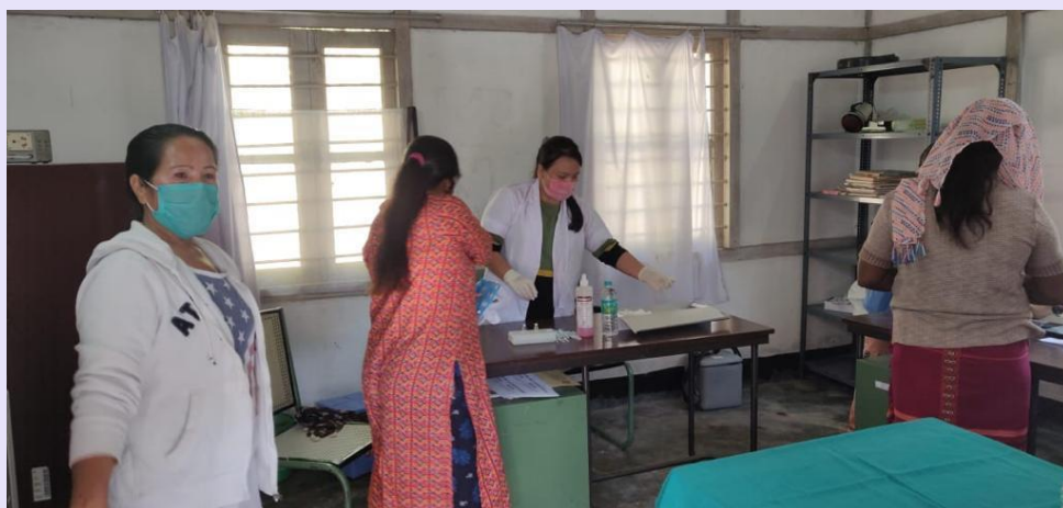
KaHPS organised a COVID 19 vaccination camp at KaHPS Health Centre in collaboration with CHC ,Bhalukpong on 14.12.2021