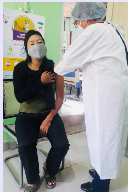
Special Covid19 vaccination session for Thilong Village, Nagaland, at NEEPCO Health Centre, DHPS, on the 25 th November 2021.