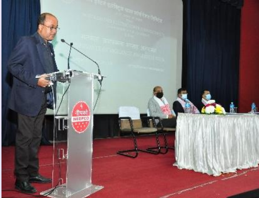
Corporate Office, Shillong