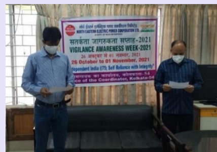
Coordination Office, Kolkata