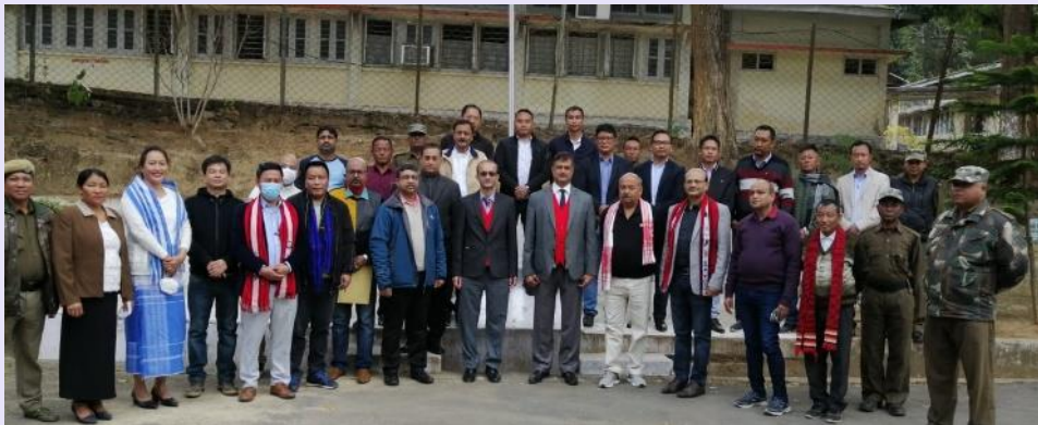
DHPS on 11.01.2022