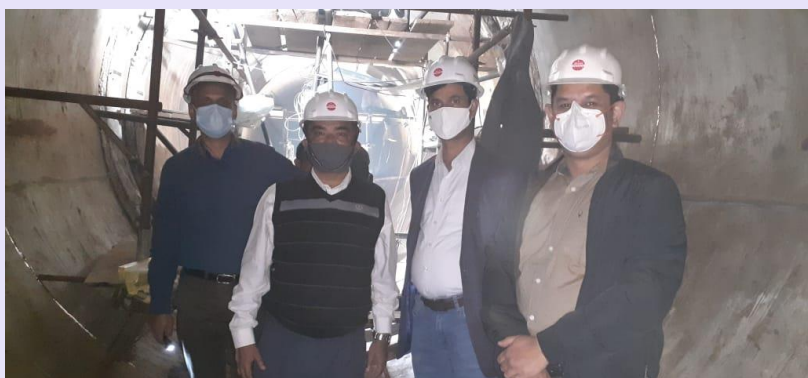
KHPS on 4.12.2021