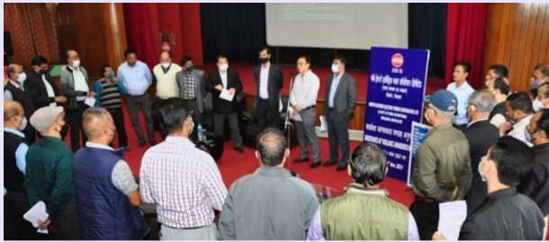
Corporate Office, Shillong