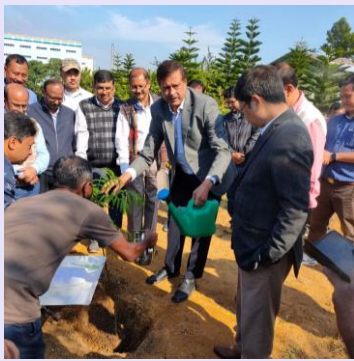
TGBPS on 18.12.2021. D(T) also visited AgGBPS