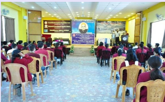
Corporate Office, Shillong