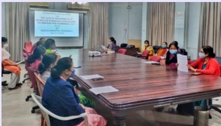
Coordination Office, Guwahati