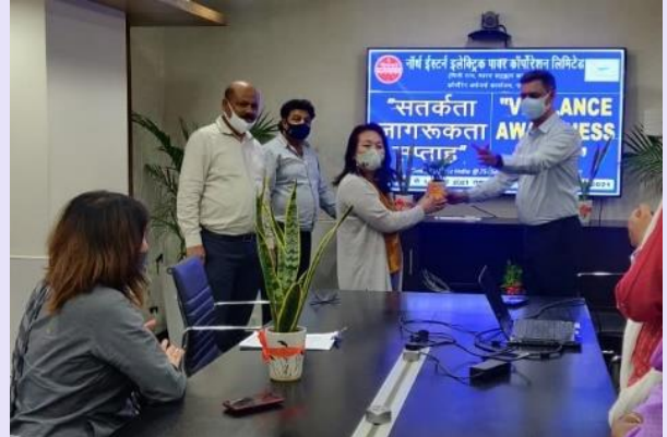
Corporate Affairs, Delhi