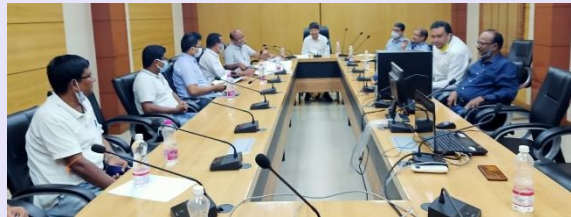
Safety Committee meeting on 29-10-21, TGBPS