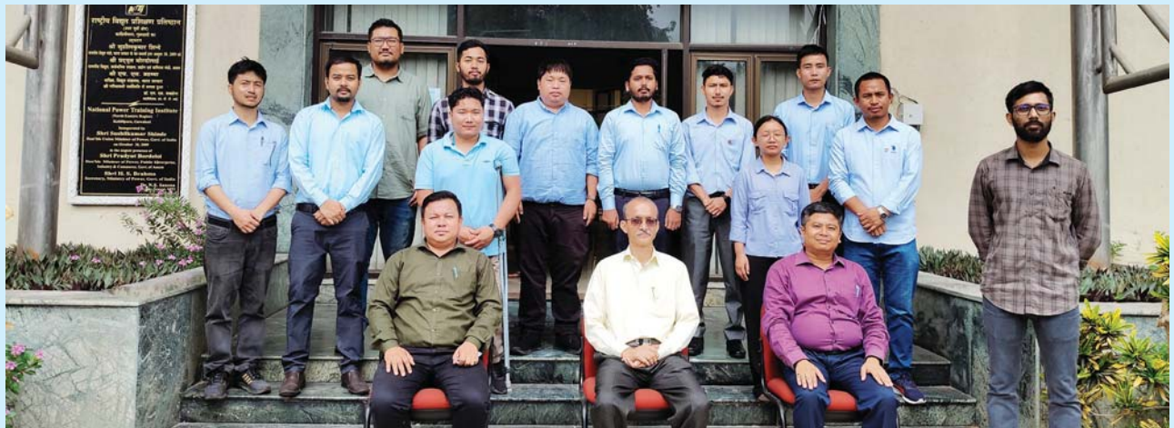
Induction programme for JES at NPTI, NER, Guwahati, 22nd May 2024