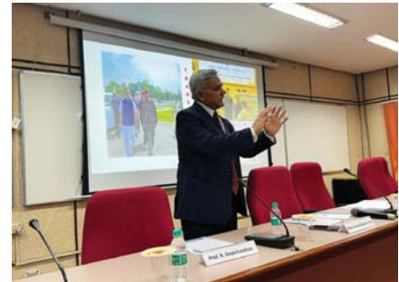
Director (P), delivering a talk at NTPC School of Business, Noida to the PGDM students, faculty and staff on the 9th May 2024.