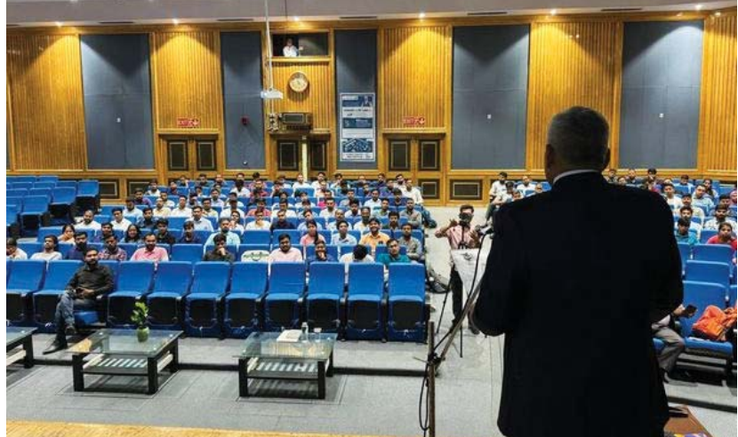
Director(P) delivering a talk at the NPTI Foundation course for the Executive Trainees of Power Sector at Faridabad on 30.04.2024