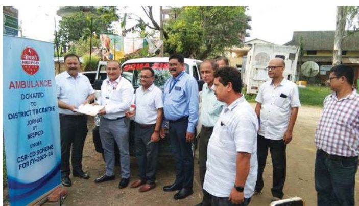
Handing over of Ambulance to District TB Center, Jorhat, Assam under CSR-CD for FY 2023-24 on 06.06.2024