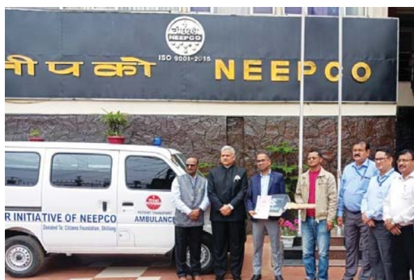
Under CSR Scheme 2023-24, an Ambulance was handed over to Citizen Foundation, Shillong by D(P) in the presence of ED(HR), CGM(HR) and other NEEPCO officials on 06.06.2024.