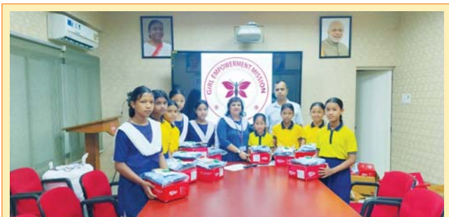
Pre Camp Activities for the NEEPCO Girls Empowerment Mission, GEM, AGBPS , Assam