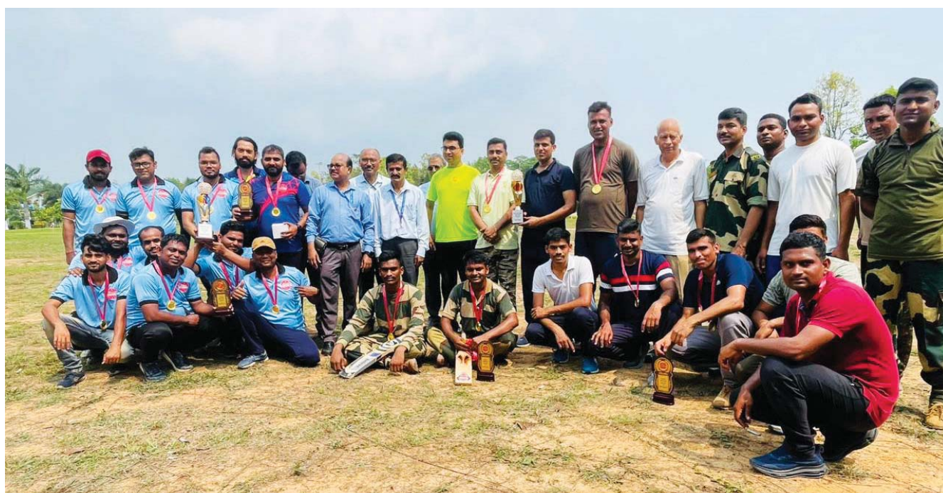
Participants in the friendly cricket match organised by TGBPS and AgGBPS