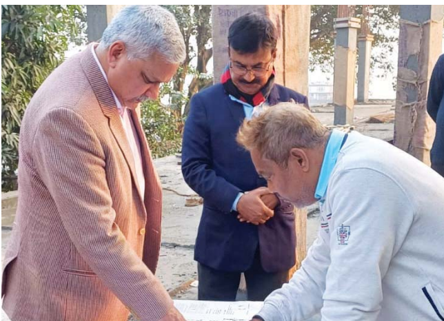
Inspecting New Guesthouse Complex (under construction) at Tezpur on 12 Jan 2024.