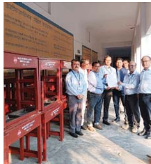
Benches handed over to Sukhamoy H. S. School, Usha Bazar and Subrai Vidya Mandir, Malabati Pata, Lembuchhara, Tripura West during March 2024.