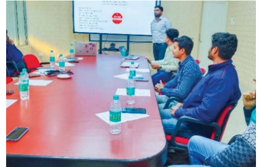
2nd Batch of Executive Trainees at AGBPS