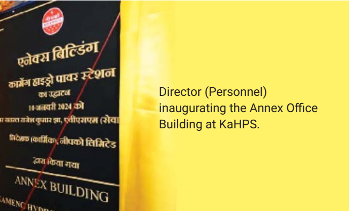
Director (Personnel) inaugurating the Annex Office Building at KaHPS.