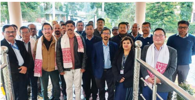
The NERPC team comprising of officers from NERPC, NERLDC and Power Grid visited AGBPS, on 22.02.2024 to review Mock Black Start Exercise & Renovation works of AGBPS