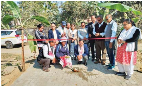
Construction of pavement at Cicia Bokuloni Playground by AGBPS.