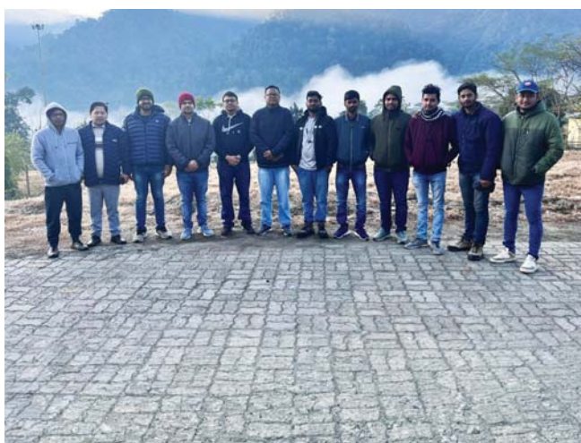
Enroute to Bichom Dam via Tenga Dam on 8th January 2024