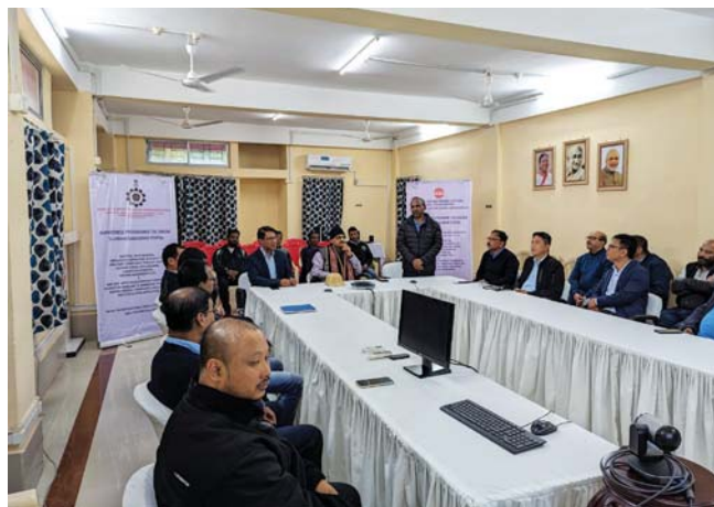
Awareness Programme on Shram Suvidha/Samadhan portal and meeting with principal employer/contractors taken by Dy. Chief Labour Commissioner (C) Guwahati on 12 January 2024 at THPS.