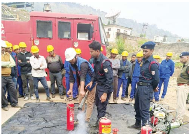
In-house training on disaster - preparedness and response organised by State Disaster Response Force (SDRF) on 7th February 2024 at DHPS.