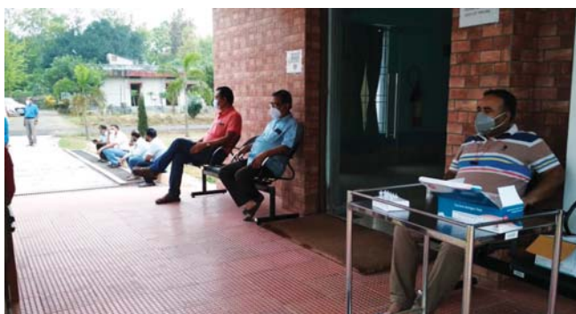
Testing & Vaccination

The events which unfolded during the pandemic with the