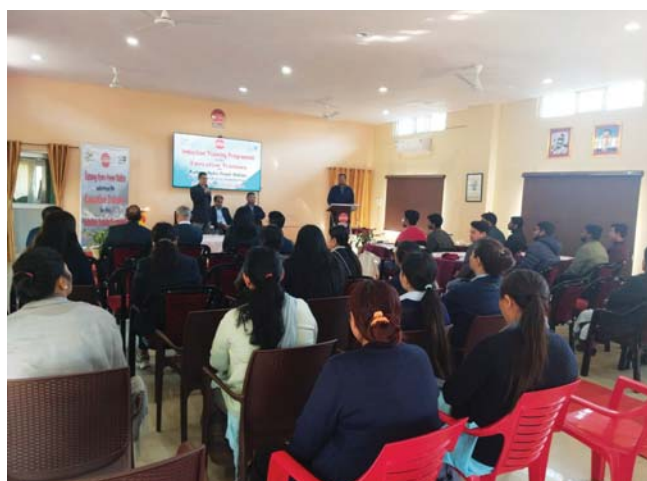
KaHPS on 9th January 2024