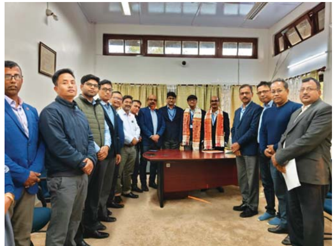
Handing and taking over charge of HoP, KHPS in between out going & incoming HOP.