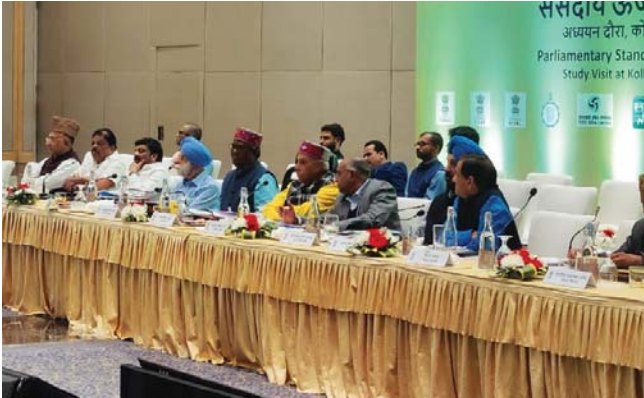
Study Visit of the Parliamentary Standing Committee on Energy at Kolkata on 6th January 2024.