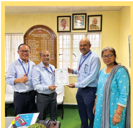
Certificate of Appreciation of National Safety Council of India awarded to NEEPCO for its Power Plant Agartala Gas Based Power Plant, Agartala. This for achieving all the compliance measures and zero incidents occurred during the last three years