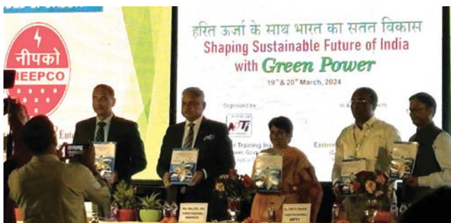
NEEPCO participated in the National Conference on "Shaping a Sustainable Future of India with Green Power" organised on 18.03.2024 at Jaisalmer by the National Power Training Institute (NPTI) Eastern Region in partnership with ERPC,CEA. In his keynote address Director (Personnel) highlighted that NEEPCO has been a frontrunner in this transition-actively investing in and implementing renewable energy projects across the Northeast and beyond.