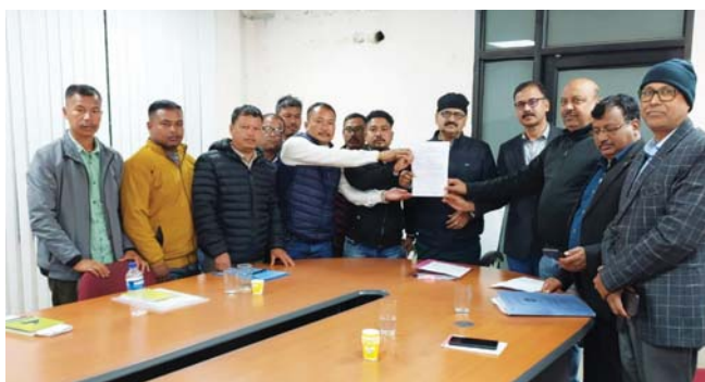
Conciliation meeting/ joint discussion between union members/ contractors and KHPS management in presence of CLC on 16.1.2024 at Guwahati.