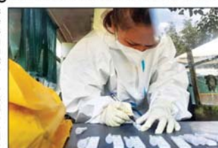
A health worker during the random sample testing for COVID-19 conducted at North Eastern Electric Power Corporation Limited (NEEPCO) Doyang on June 23.