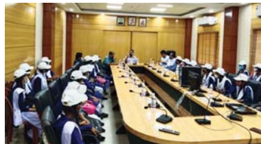
Visit of School students of Dhanpur, Sepahijala, Tripura to project site at TGBPS.