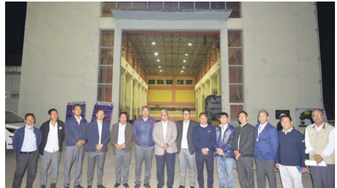
Doyang Hydro Power Station on 18.01.2024