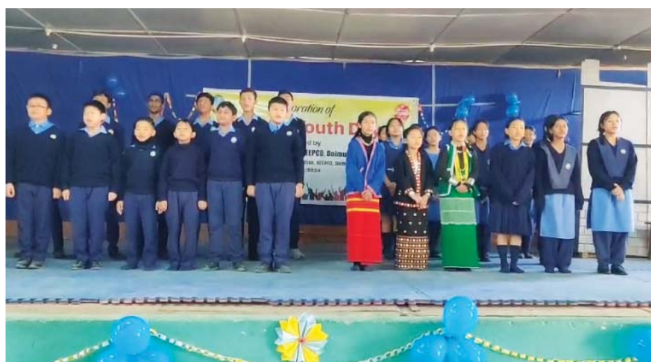
At VKV, Nirjuli