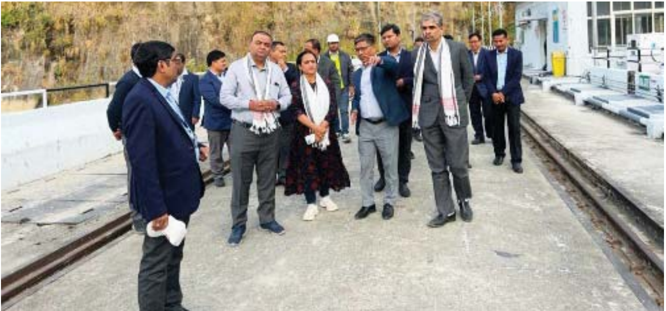
Independent Directors of NTPC at PHPS Dam site, Jampa on 3rd January 2024