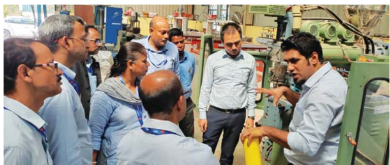
3 months Skilled Development Training Programme for 20 unemployed youths of Old Agartala R. D. Block through CIPET, Ministry of Chemical & Fertilizers, Govt. Of India.