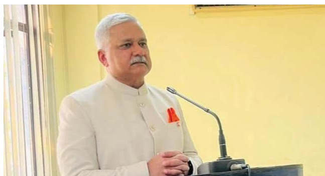
Director (Personnel) speaking at the Re-Skilling / Re-Training Program for 22 employees at NPTI (NER) on the 9th January 2024.