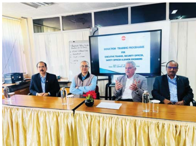
Induction Programme for the Junior Engineers, Security Officer (FTB) and Safety Officer (FTB) at Corporate Office