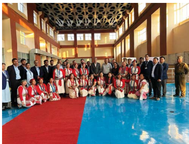
At PHPS Power Station, Sopo