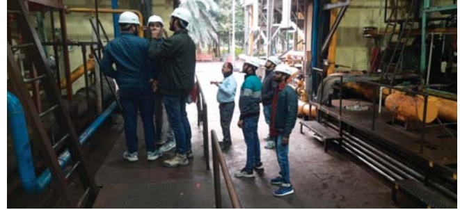
DGM( E/ M) briefing the trainees on the Plant Electrical Maintenance & Switchyard of the Power Station, AGBPS