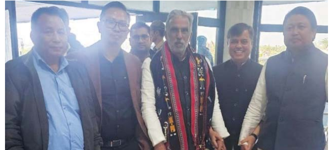
Shri Krishna Pal Gurjar, Hon'ble Union Minister State for Power and Heavy Industries, Govt. of India visited Dimapur, Nagaland to review the various schemes run by the Central Government. The Hon'ble Minister was received at Dimapur by the senior officials of DHPs, NEEPCO on 7th January 2024.