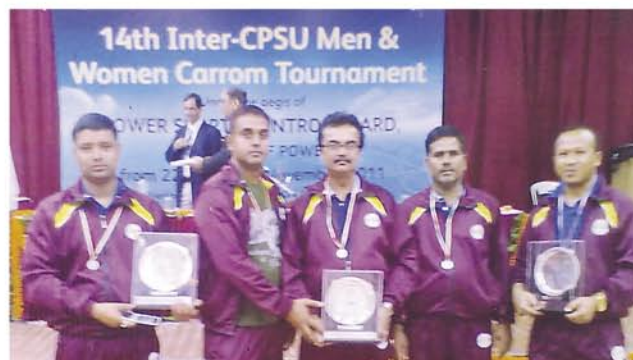
NEEPCO Team with their Second Runners Up trophy