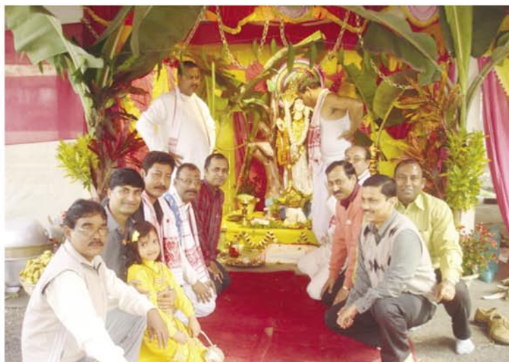
Saraswati Puja at AGBP