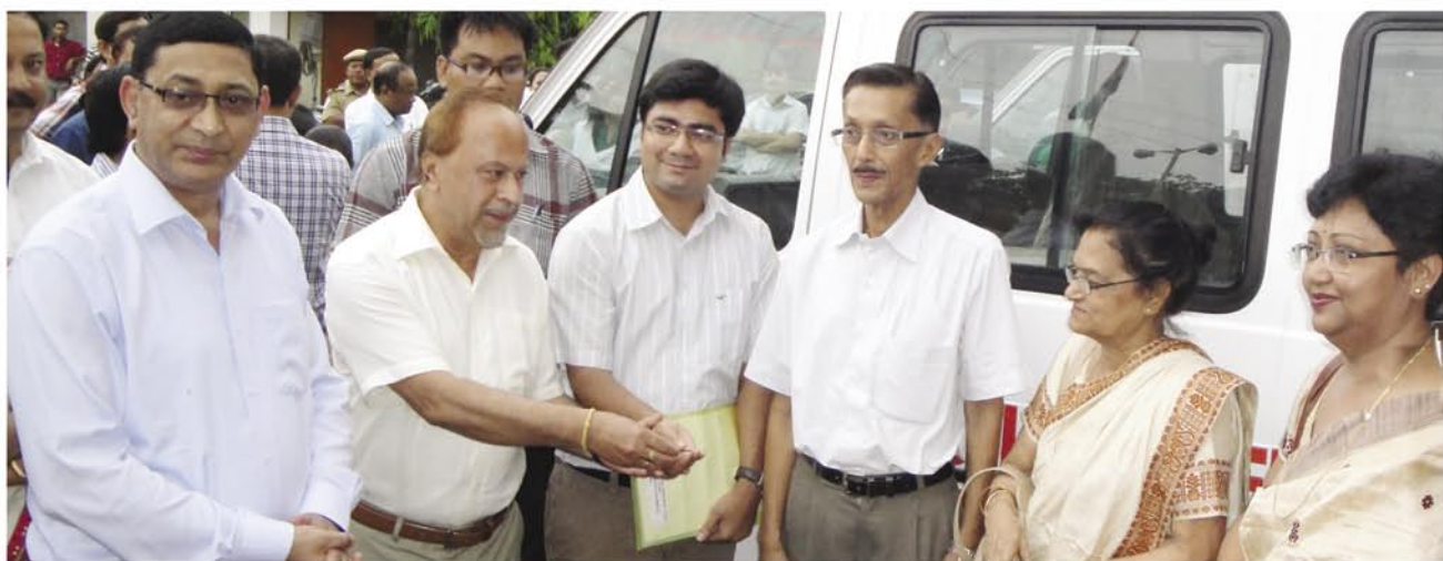
Ambulance being handed over to Deepsikha (Cancer Care Foundation) Guwahati