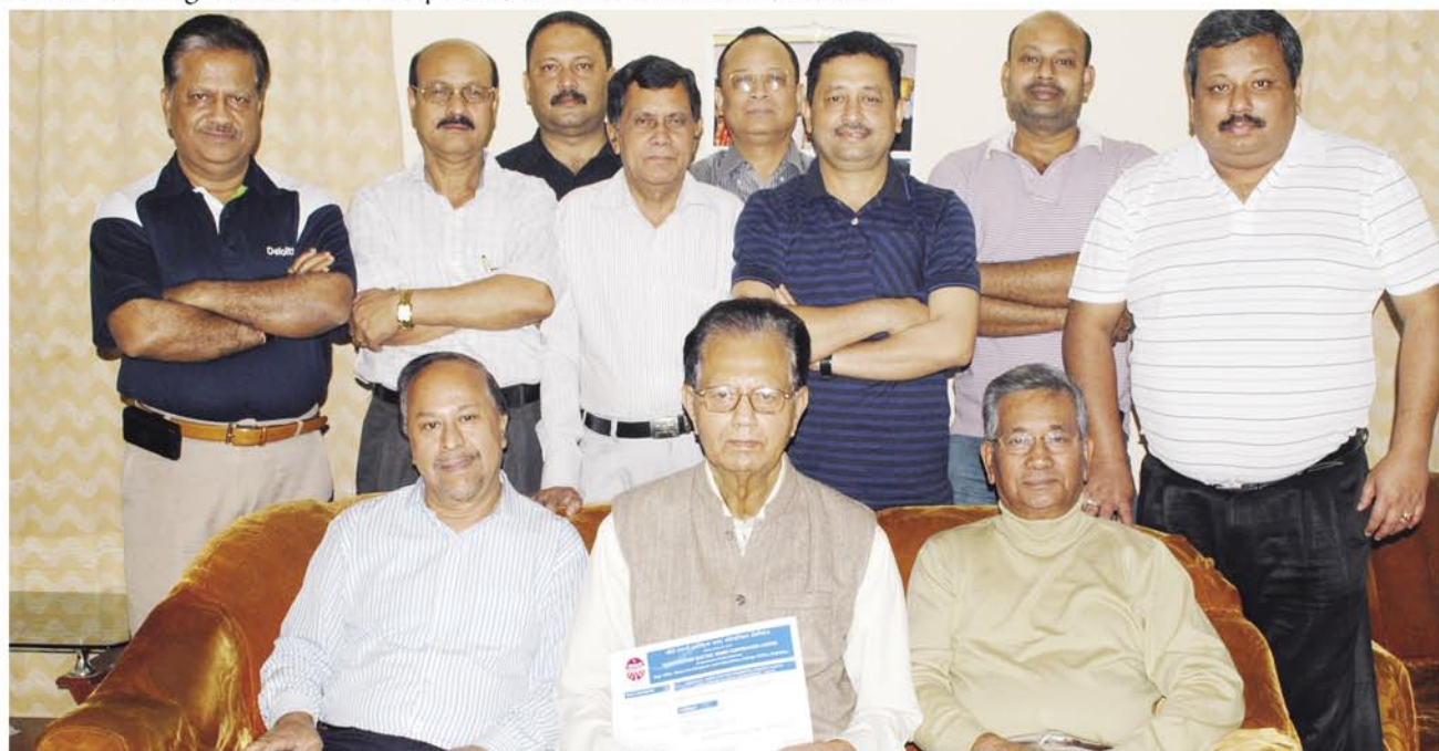
A cheque of ₹ 6 lakh was handed over to the President of North East Tennis Federation, Guwahati to promote local talent.