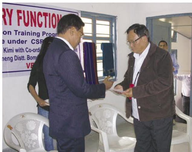
Scholarship handed over to one of the parents

Meritorious Scholarship for the year 2011-12 given to :