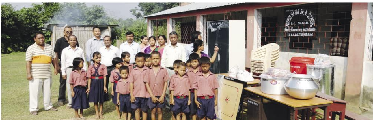
Furniture, utensils and sports materials were donated to Pukhuri Hatai Jr. Basic School, West Tripura.