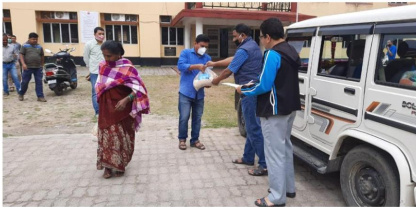
Pare HEP, Arunachal Pradesh