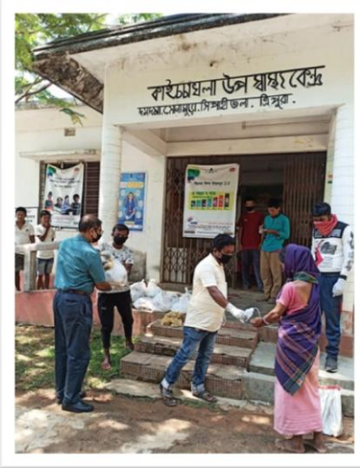
TGBPP, Tripura : Relief materials distributed among poor people