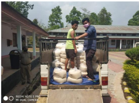
Kopili HEP, Dima Hasao, Assam