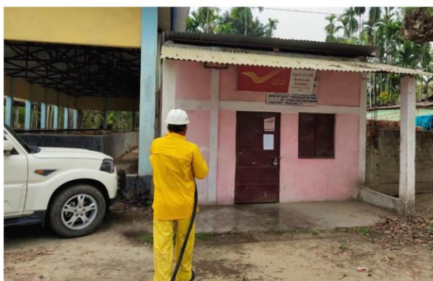
Bokuloni Chariali Post Office