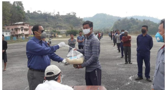
Ranganadi HEP, Arunachal Pradesh