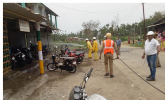
Bokuloni market place